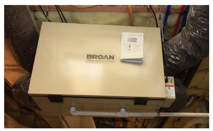
Figure 1: Heat Recovery Ventilator (HRV) used to provide mechanical ventilation in a residential application.

Advanced designs of new homes and updated building codes are starting to feature mechanical systems that bring outdoor air into the home in a controlled or managed way. Some of these designs include energy-efficient heat recovery ventilators (HRV's - see Figure 1) and energy recovery ventilators (ERV's).